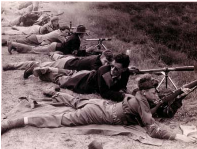
This photo was taken by the Daily Telegraph and show some of the 1949 school team in action at Bisley. The photo was supplied by JS Knox.

The team finished 12 th in the Ashburton with a score of 502, 10 points behind Glenalmond.